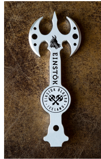
EINSTÖK TAP HANDLE

EINSTÖK SCOTCH ALE AGES WELL. IF YOU HAVE THE PATIENCE TO WAIT.